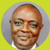
Hon. Vincent Bamulangaki Ssempijja Minister of Agriculture, Animal Industry & Fisheries (Uganda)