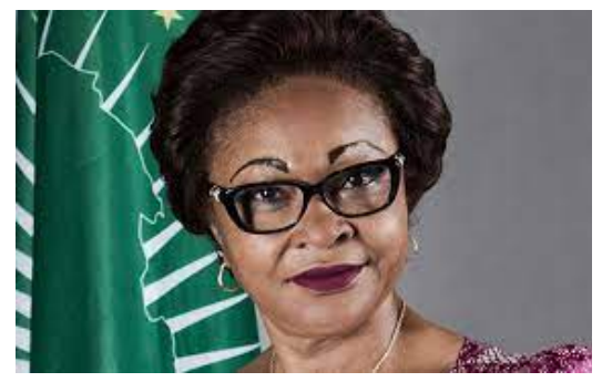
How the Russia-Ukraine conflict impacts Africa